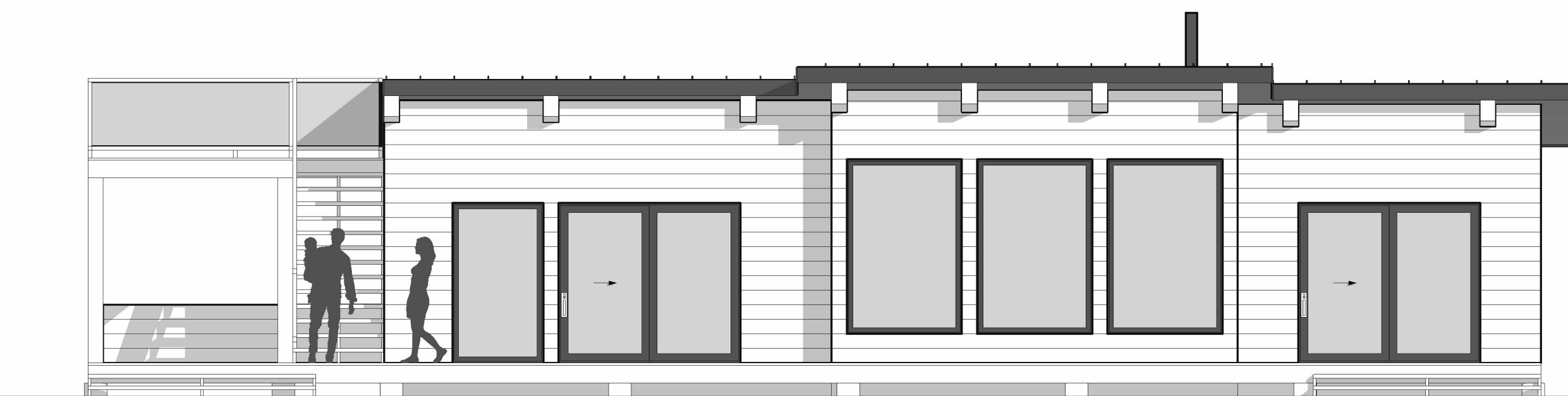
E3 Elevation 3 - RD 3/16" = 1'-0"