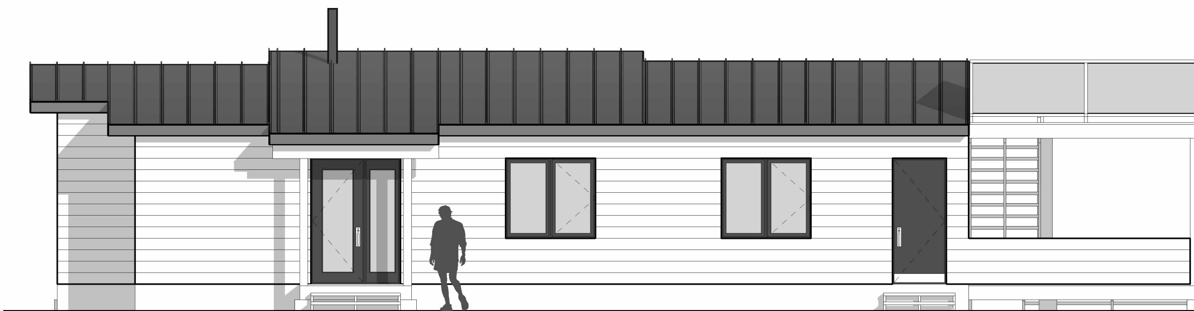
E1 Elevation 1 - RD 3/16" = 1'-0"