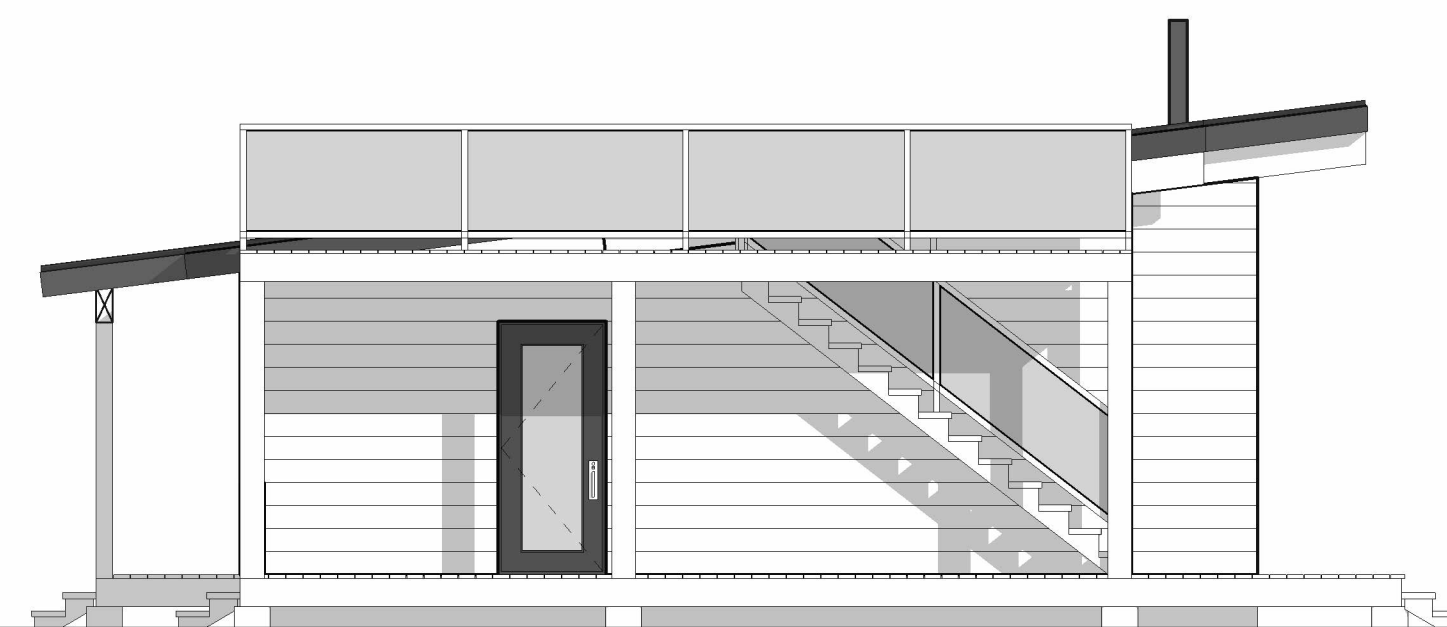
E4 Elevation 4 - RD 3/16" = 1'-0"