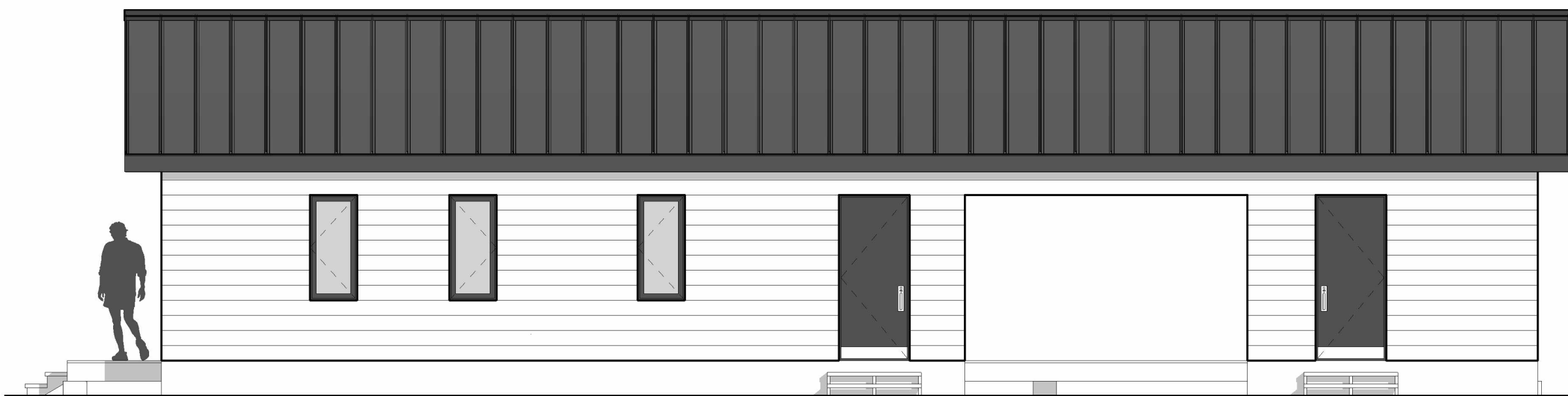
E1 Elevation 1 - DT 3/16" = 1'-0"