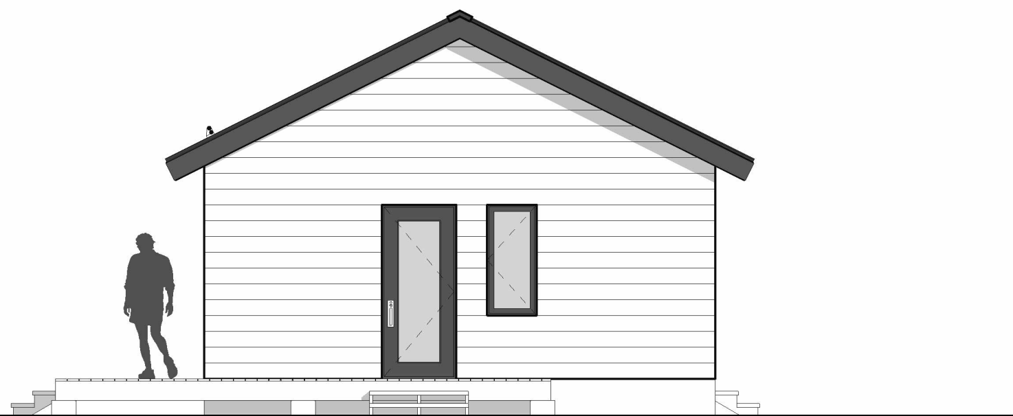
E2 Elevation 2 - DT 3/16" = 1'-0"