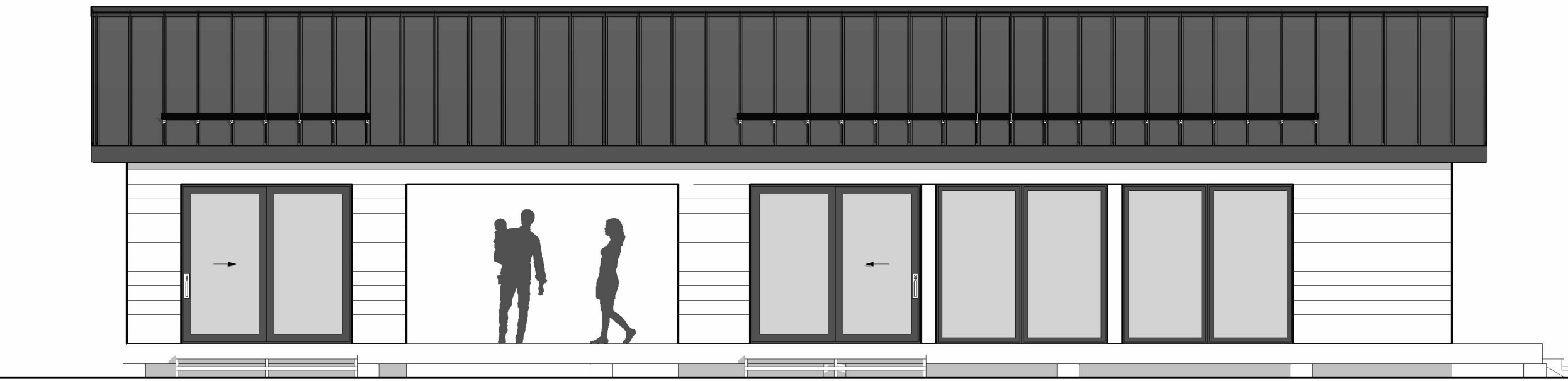
E3 Elevation 3 - DT 3/16" = 1'-0"